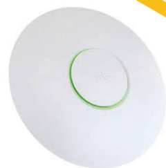
1X ACCESS POINT