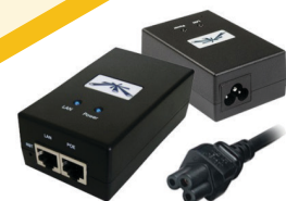
1X POE INJECTOR INCLUDING POWER SUPPLY

(IF ANY OF THE BELOW EQUIPMENT IS MISSING, PLEASE CONTACT US ON 0845 900 3974)